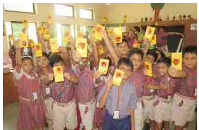
Pledging to paint our world in vibrant colours