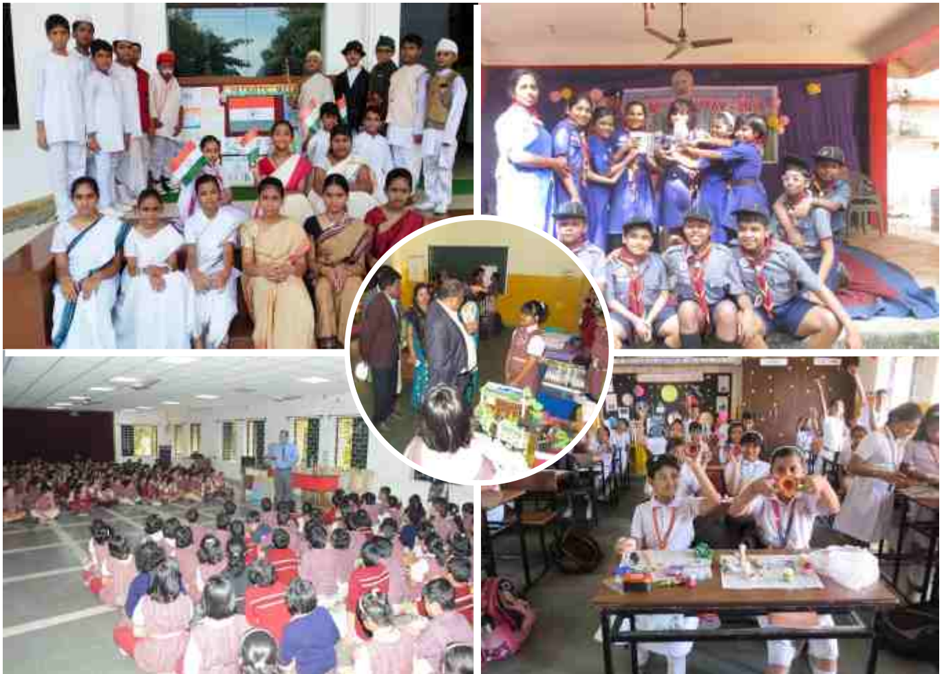
Tinytots learn through activities