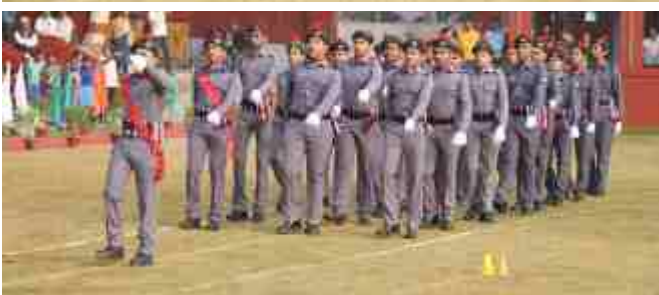
House March and Civil Defence Contingents