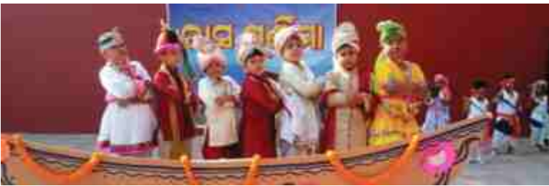
Instilling Values and Hounoring the heroes