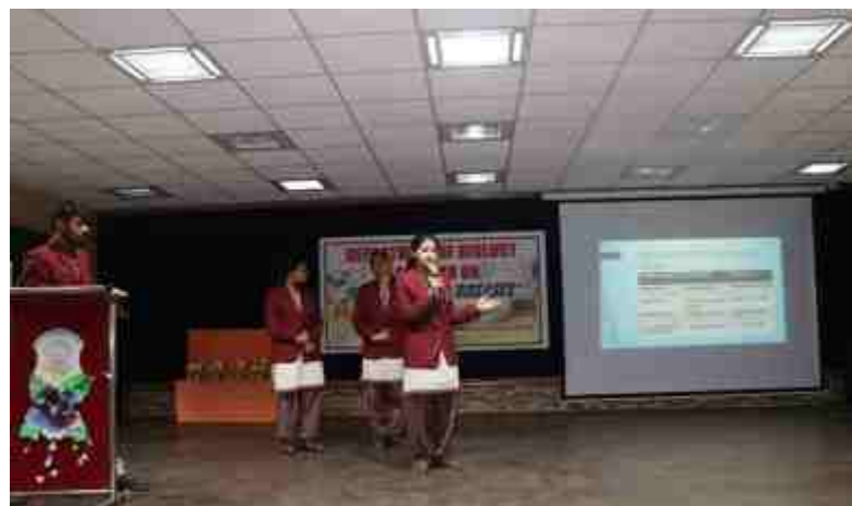
Seminars and Symposiums