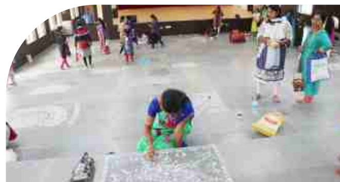
Collaborating with Parents