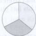
India's first Ranking

■ Milk, Pulses and Jute ■ Fruits and Vegetables □ Cereals