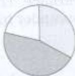
India's first Ranking

■ Milk, Pulses and Jute ■ Fruits and Vegetables □ Cereals