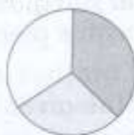
India's first Ranking

■ Milk, Pulses and Jute ■ Fruits and Vegetables □ Cereals