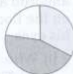
India's first Ranking

■ Milk, Pulses and Jute ■ Fruits and Vegetables □ Cereals