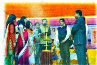
D.C. & A.C., Jamtara inaugurating the School Function

Every year the school celebrates Day to bring the latent talents of provides a platform to create patriotism in the students by festivals like The Independence Jayanti etc. The school also bears celebrating the birthdays of great