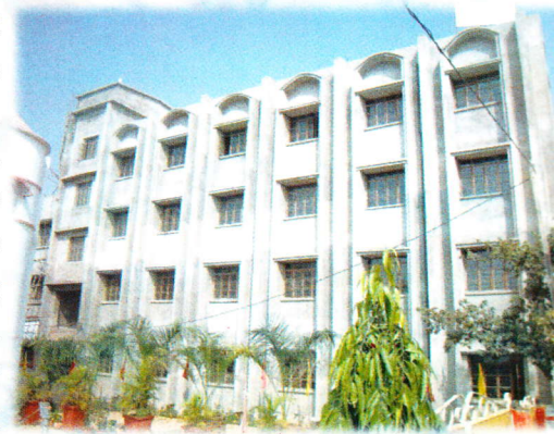
Newly Constructed Senior School Building

SAVITRI DEVI D.A.V. PUBLIC SCHOOL, JAMTARA (Jharkhand) is situated just 2 kms away from Jamtara Railway Station and Bus-Stand at Namupara in the out-skirts of Jamtara Nagar Panchayat with lush green environment. The school came into existence in the year 2002 in collaboration with Siksha Vikas Trust, Jamtara with a view to provide qualitative English Medium Education to the tribal and deprived children of Jamtara and its adjoining areas. Since then the school has improved leaps and bounds and now it has become the most leading and reputed educational institution of Santhal Pargana in Jharkhand. The school got C.B.S.E. affiliation in the year 2009 and has become a full-fledged Senior Secondary School with the largest students' strength and the most competent constellation of teachers in the town. Presently, the school owns 5 acres of land. The school runs in a two storeyed building annexed to the newly constructed four storeyed senior school building.