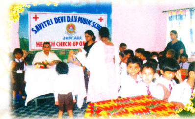
Routine Health Check-up

(d) HEALTH : The school is about the health students and school organises Check-up camp