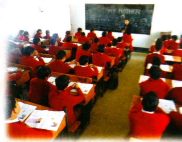
A lively class-room interaction between the teacher and the students.