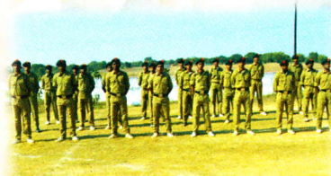
N.C.C. : A March towards Nation Building

(g) Facility of N.C.C. : been accredited to 36, N.C.C. Battalion, I.S.M. Dhanbad to inculcate the young students to for the safety and motherland and to prepare future defence The school has been sanctioned 100 cadets.