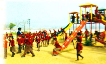
Learning through Play-way method

(h) FACILITIES FOR TINY-TOTS : The recreational facilities like Swing, Merry-Go-Round, Slider, See-Saw, Multi-play System etc. are available for Tiny-Tots in the school. Educational kits are also provided to the Tiny-Tots by the trained and caring nursery teachers. The kids are being educated everyday through play-way method in Dayanand Children's Park.