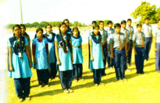
Scouts & Guides inculcating social

(j) IDENTITY CARDS : The school provides Identity Card to each and every student bearing a stamp-size photograph address of the student which always remains with the student for his/her identity.