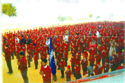
Praying for the blessing of the Almighty in the morning assembly.

The morning assembly is an integral part of the school curriculum. As charity begins at home, the school begins with morning assembly that includes Vande-Matram, Vedic Mantras, School Prayer, News Headlines, Topic of the day, Quiz, Thought for the day and Poem recitation by tiny-tots. Everyday a moral lesson is delivered by a learned teacher to inculcate moral values in the students. The assembly disperses with the National Anthem. Besides this, on every Thursday, Cleanliness Day is observed in the school for developing interest towards cleanliness and personal hygiene.