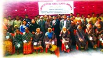
Distribution of Blankets among 'Have-nots'

In order to link the students with the social problems and challenges, the school undertakes the programmes of providing relief to the "Have-nots" with the distribution of woollen clothes during cold winters & distribution of materials among the victims of natural calamities like Flood, Earthquake, Tsunami etc.