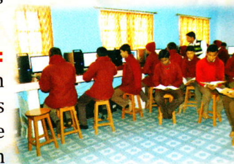
Preparing I.T. Professionals for the future in the Computer Laboratory

(c) COMPUTER LABORATORY : For preparing future I.T. professionals, the school imparts computer education to its students by trained & experienced I.T. faculties.