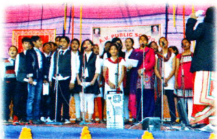
Group Song on Children's Day Celebration

For the holistic development of the pupils atmosphere of healthy competition and team curricular activities are governed by House-Houses in the school named after the reformer -Swami Dayanand Saraswati as renowned mathematician and scientist, "House", in the name of the Father of Nation