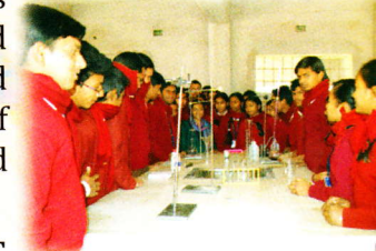
Experiments in Chemistry Laboratory

Geography, mathematics & laboratories required been provided guidance of experienced