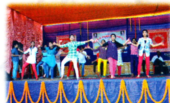
Cultivating Cultural Heritage

and to create spirit, most of the System. There are renowned social "Dayanand House", Aryabhat as "Aryabhat" and the great