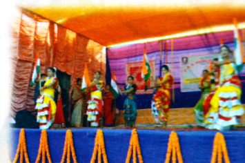
Emphasizing on Co-Scholastic Activities

its Annual Day & Annual Sports the students. The school general awareness celebrating different National Day, The Republic Day, Gar its social responsibilities social reformers like Sw