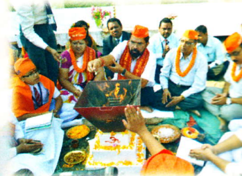
Hawan : The Synchronicity Hon'ble A.C., Jamtara performing

In order to establish a cordial relationship between the school and the parents in respect of the holistic development of the child, P.T.A. meetings are held regularly after every Formative Assessment & Summative Assessment to discuss about the progress of children.