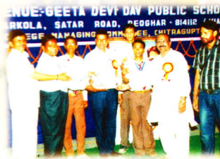
Regional Director Awarding Zonal Winners

(f) Sc. EXHIBITION & ART GALLERY : The school undertakes Science Exhibition & Art gallery every year to impart knowledge of learning by doing.