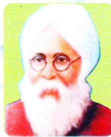
Mahatma Hansraj Ji

the Arya Samaj, a progressive Dayanand Saraswati in 1875, the India, who led a crusade against practices that prevailed in to bring about a balanced and future citizens of this country Vedic Culture and a high sense of school at Lahore in 1886 by the