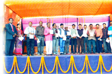
The Principal and Hon'ble D.C. of Jamtara congratulating the p of the students securing C.G.P.A. 10 in the year 2013

As regards to the school's Scholastic and Co-Scholastic achievements, the school has made a mark in the Bihar Zone-II with the phenomenal performance displayed by our students in the C.B.S.E. and D.A.V. Education Board Exams, National Talent Search Competitive Exams, Science, Maths & Cyber-Olympiads, Zonal Tournaments, Zonal Youth Festivals, Zonal Vedic Chetna Shivirs and many more different competitive exams and tournaments conducted at State and National levels.