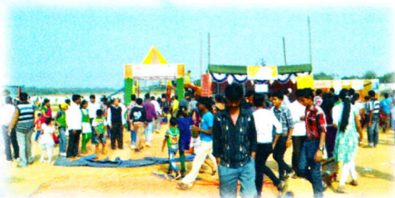
A glimpse of Science Mela

Every year the school celebrates Day to bring the latent talents of provides a platform to create patriotism in the students by festivals like The Independence Jayanti etc. The school also bears celebrating the birthdays of great