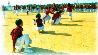
Empowering girls' Personality

Solo song and group songs based on classical and patriotic, Folk dances, Kathak and Bharatnatyam etc. All these curricular activities are practised regularly on every Saturday for the physical, mental, social, cultural and emotional development of children.