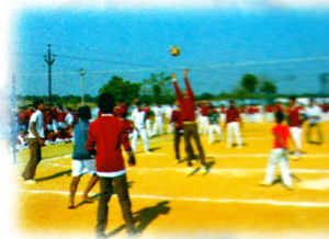
Volley-Ball : Energetic game to enhance

and to create spirit, most of the System. There are renowned social "Dayanand House", Aryabhat as "Aryabhat" and the great