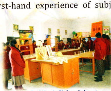
Concept Building in Biology Laboratory

(b) SCIENCE LABORATORY : To give first-hand experience of subjects like Physics, Chemistry, Biology, Mathematics & well-equipped Physics, Chemistry, Biology, Social Science with all facilities have under the trained & teachers.