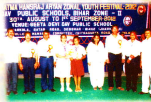
Co-Scholastic Achievements at Zonal Level

(d) HEALTH : The school is about the health students and school organises Check-up camp