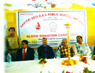
Blood Donation Camp being Inaugurated by Hon'ble Chief Minister, Jharkhand, Shri. Manu Sheela, at Jamtara in the School premises on 25th November, 2014. Instill the values of Charity & Philanthropy in Children.