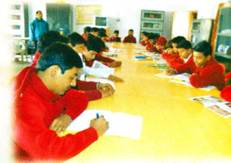
Enriching knowledge in well furnished Library-cum-Reading Room

(a) LIBRARY : To update the knowledge of students & to face the global challenges, the school provides a library-cum-reading room facility to each and every child. The school library is enriched with useful books like Encyclopaedia, Journals, Periodicals, Comics, G.K. Books, Reference Books, Competitive Magazines, Newspapers in Hindi & English.