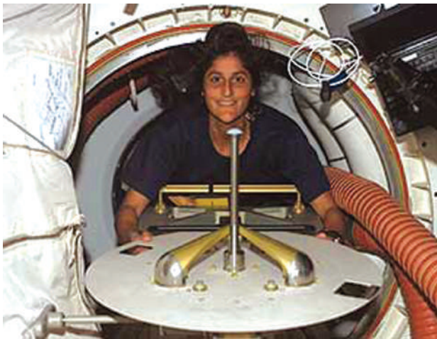
Sunita Williams coming out of spaceship

As Sunita Williams ended her space journey in United States, her relatives back home in Gujarat could not stop their tears of joy. 'She has landed safely by the grace of God. It is a moment of great joy for all of us,' said Sunita's uncle. Her relatives came out on the streets and danced till daybreak, bursting crackers and beating drums!