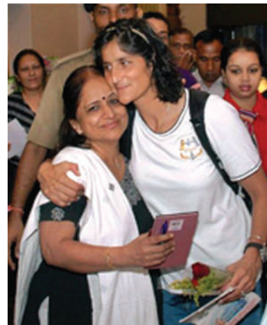
Sunita Williams with her relatives