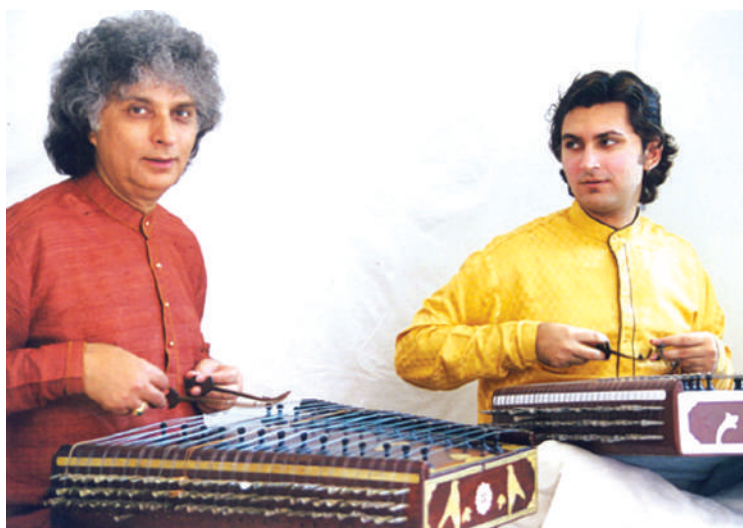
Pt. Shiv Kumar Sharma and his son Rahul Sharma

In some families, the food habits or style of dressing of some of the members are similar. Some members of a family may not like some dish or the whole family may be fond of kheer (rice pudding). In the same manner, many children follow the occupations of their parents or relatives like the son/daughter of a sports person wants to follow the same sport. The children of singers, artists, actors, builders, goldsmiths or doctors may follow the footsteps of their parents or they may want to take up some other work.