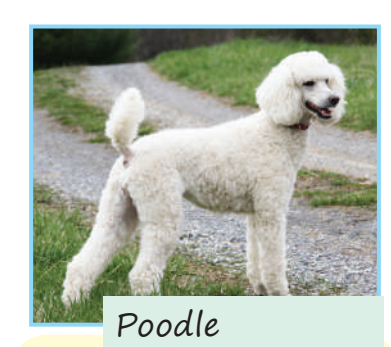
Performs in circus shows.