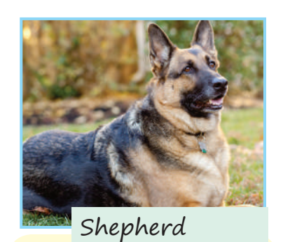
Takes care of grazing animals.

Look at the illustrations of some different breeds of dogs and how they serve us.