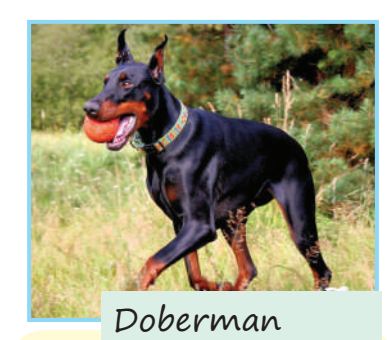
Helps police to catch thieves.