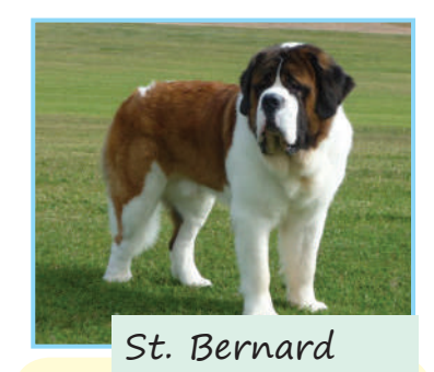
Saves people caught in storms.