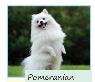
Gives good company.