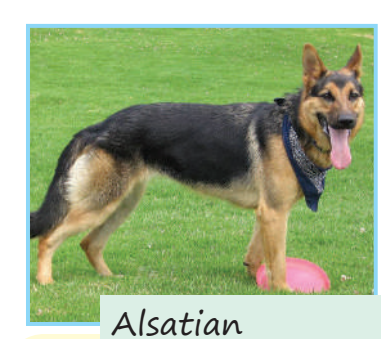
Guides those who cannot see.