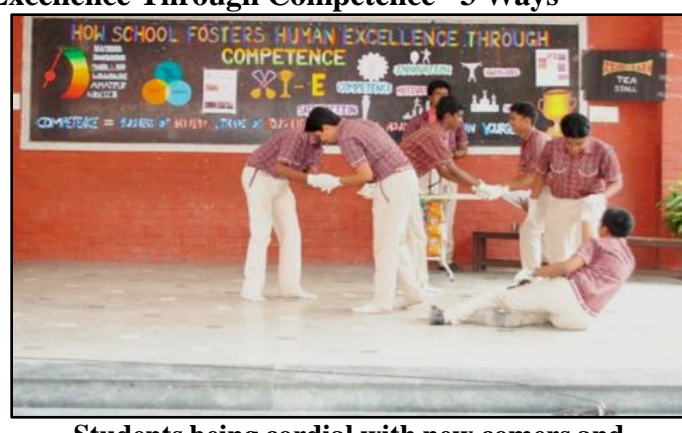
Students being cordial with new comers and aiding in building competency