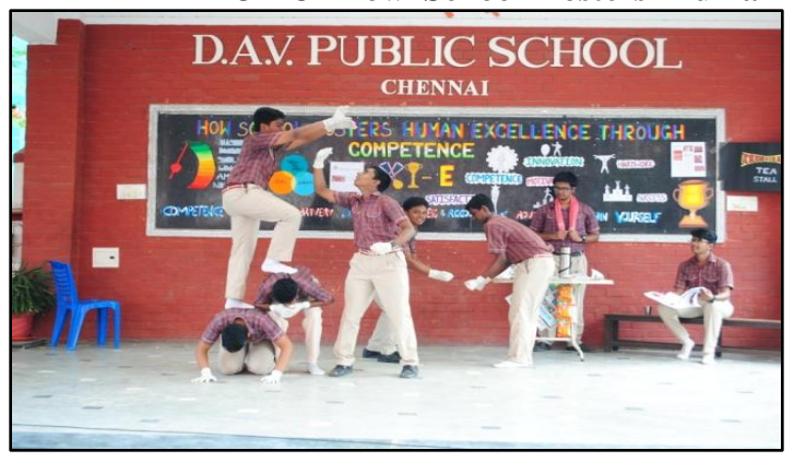
\label{eq:mime-building} \textbf{Mime-Building competency}

TOPIC: How School Fosters Human Excellence Through Competence—3 Ways