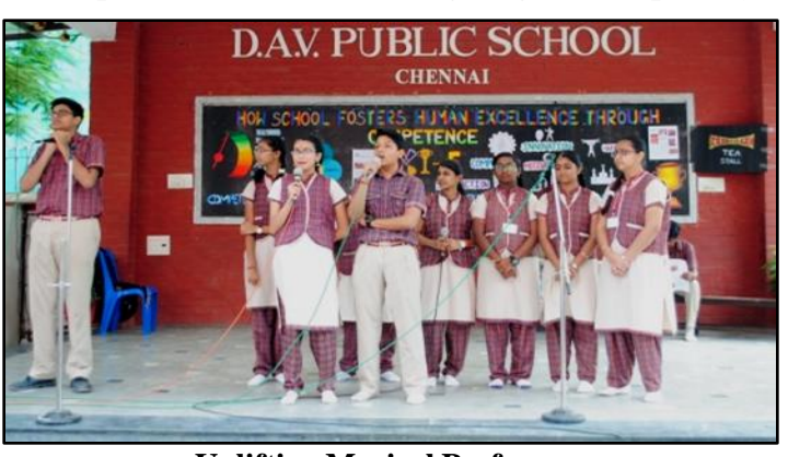
Uplifting Musical Performance