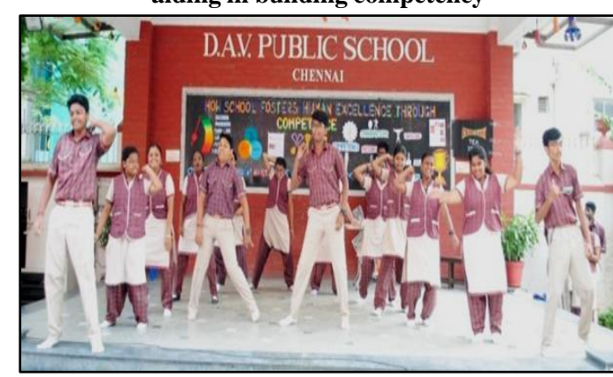
Lively dance performance