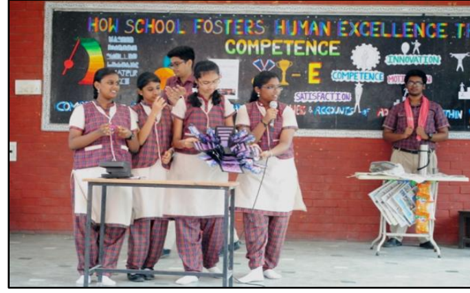
Display of the Invitation Card