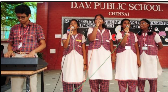
Expression of Gratitude through Music