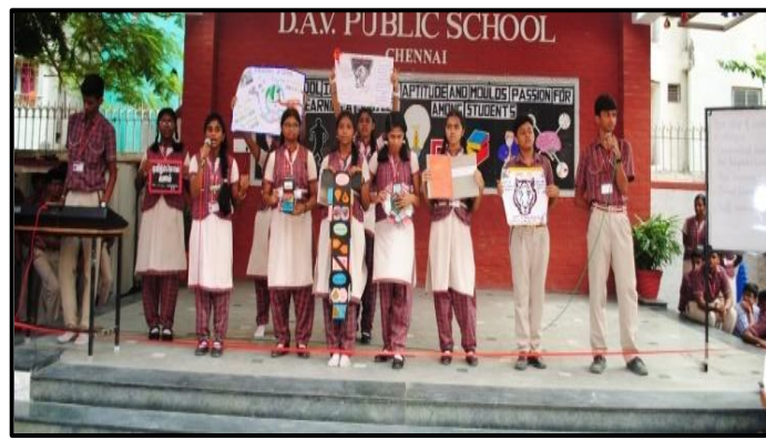
Display of Art Integrated Projects