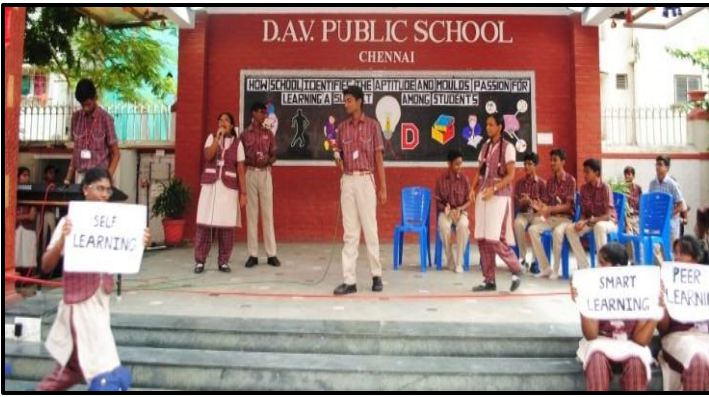
A Skit depicting significant 'Learning Styles'