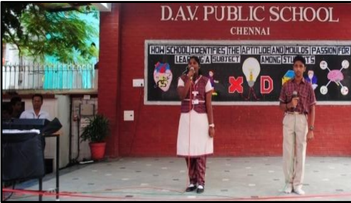
An Enlightening Speech on the theme 'Aptitude and Passion'