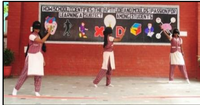
Passionate Dancers perform a daring Blindfold Act