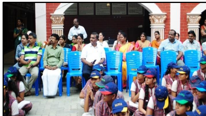
Supportive Parents watch the Spectacular Show