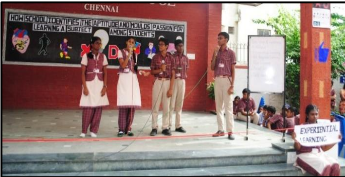
Experiential Learning through SEWA Project