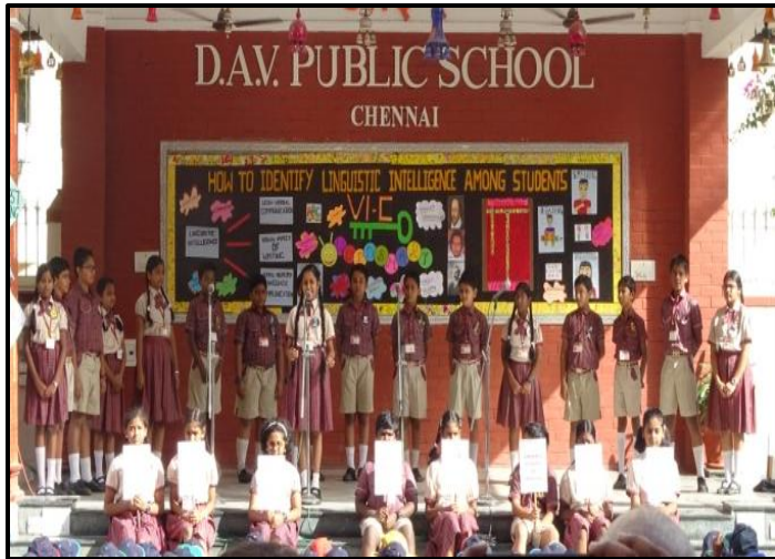
Skit on how to Identify Linguistic Intelligence

3 PROMINENT PERSONALITIES WITH LINGUISTIC INTELLIGENCE