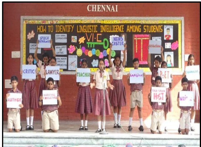
Professions fit for a Person with Linguistic Intelligence