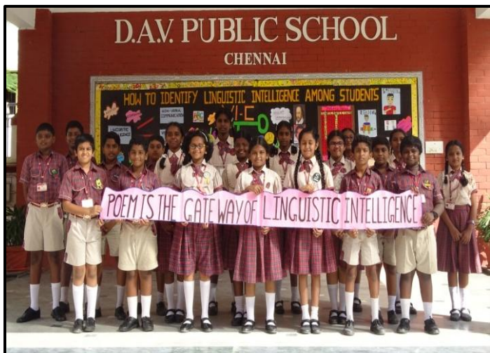
A Song on parts of speech