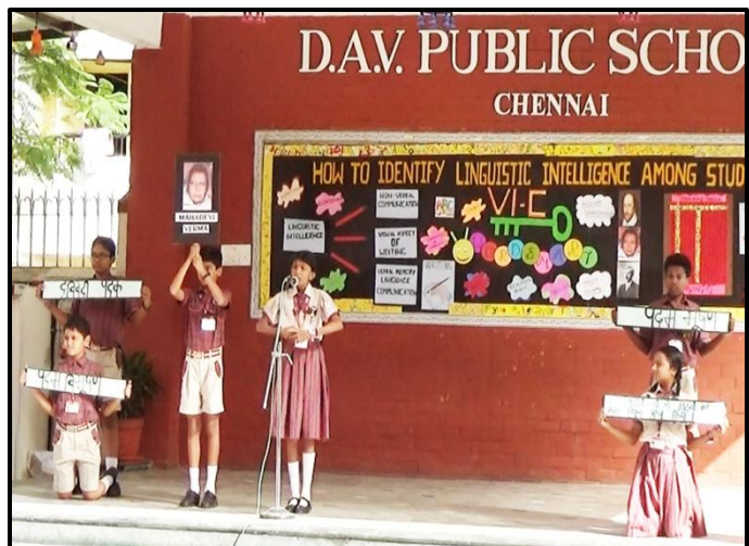
Linguistic Intelligence of Mahadevi Verma