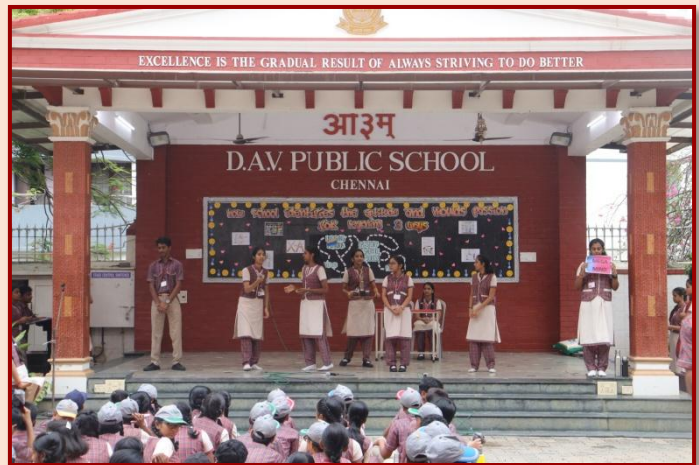
Unleashing Euphoria: A Spectacular Interschool Experience