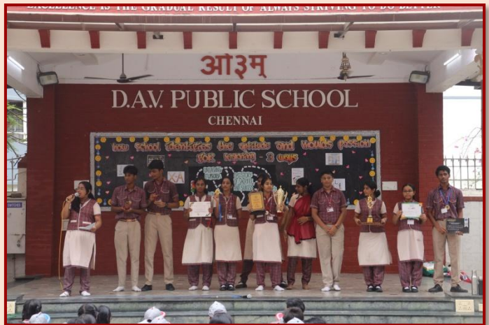
Honouring Our Winners at 'Echoes of Honour'