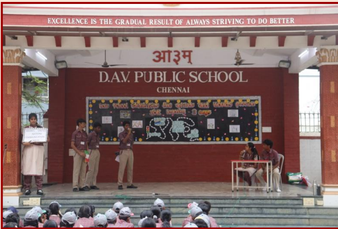
Model United Nations: A Platform for Aspiring Leaders