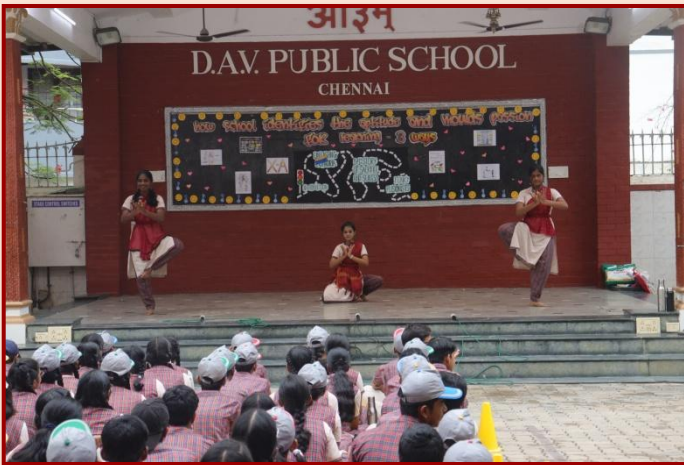
A Captivating Classical Dance Performance for the Soul