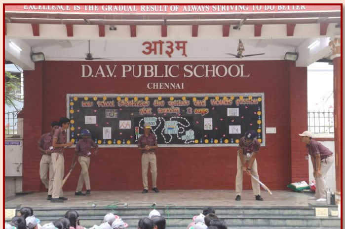
Real Life Inspiration Captured in Our Skit Performance