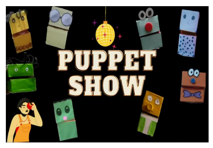
"Puppet Show" – Inculcating creativity through competitions