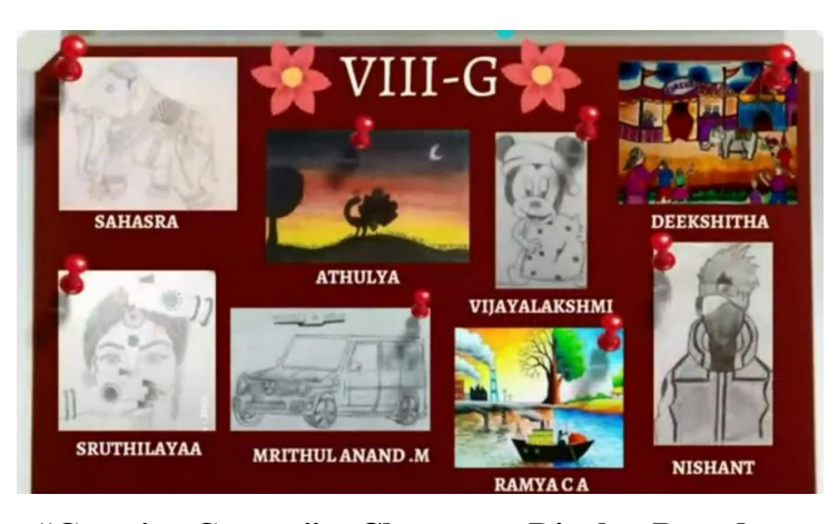
"Creative Corner" - Classroom Display Board