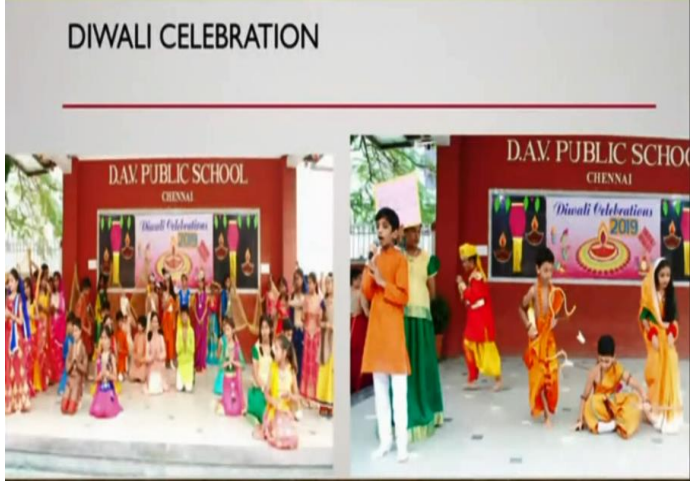
Presentation of Assembly and Celebration Pictures