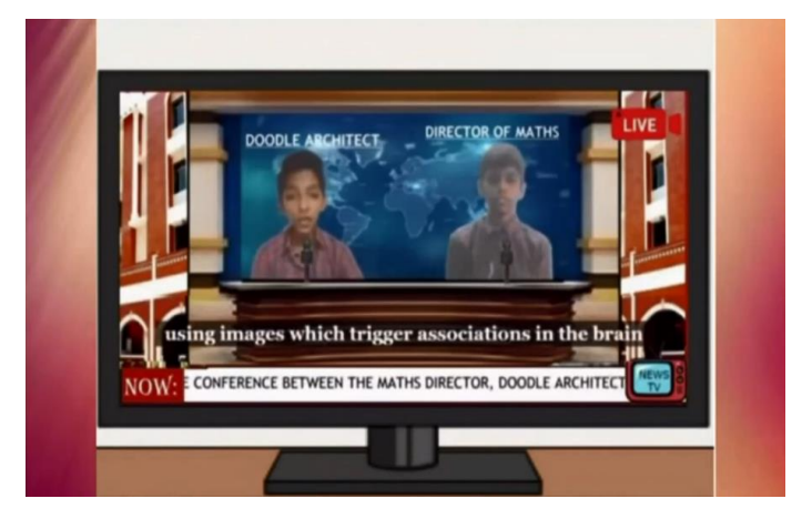
"Classroom Manoeuvres" – Activities Based Learning