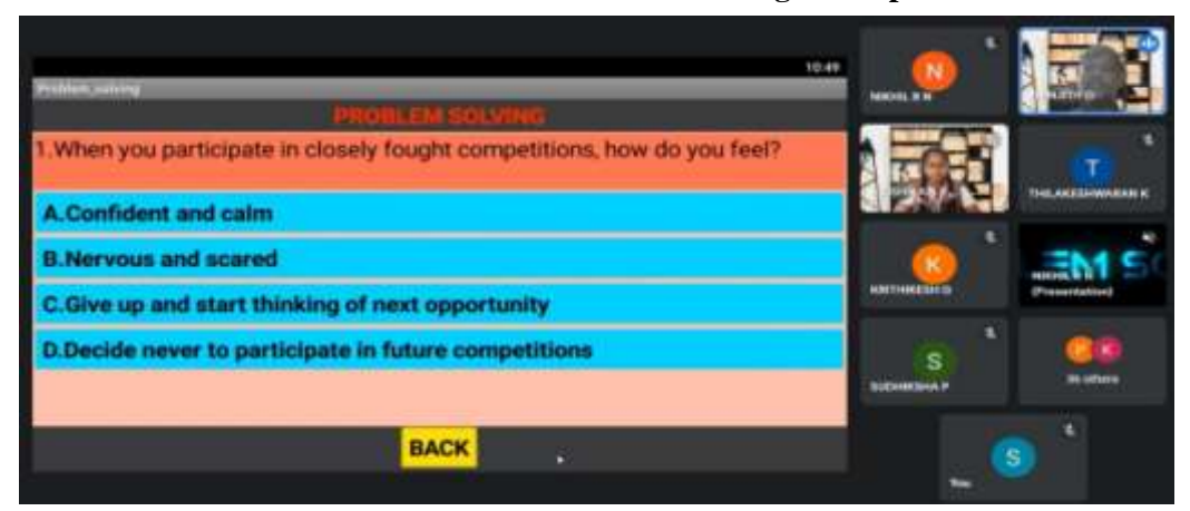
Problem Solving – Attribute of Emotional Maturity