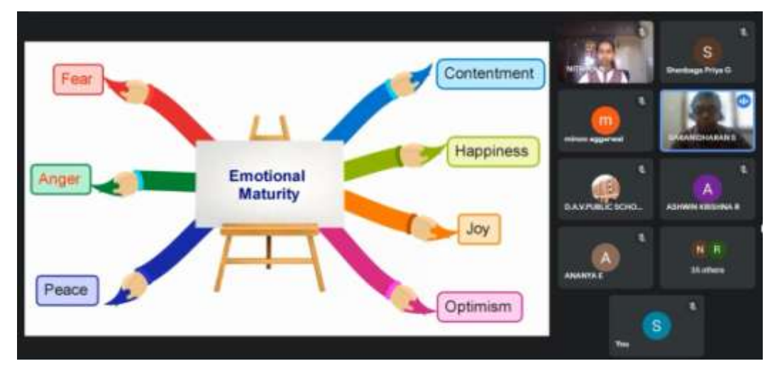
'Curtain Raiser' - Introducing the Topic