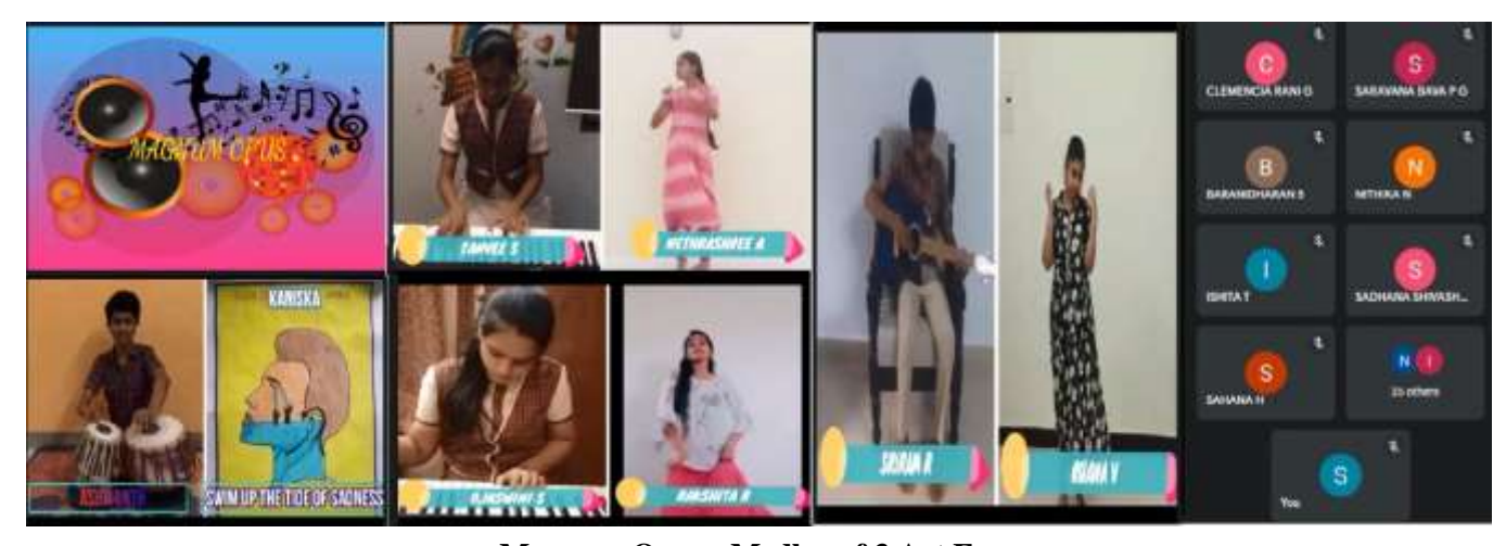
Magnum Opus - Medley of 3 Art Forms