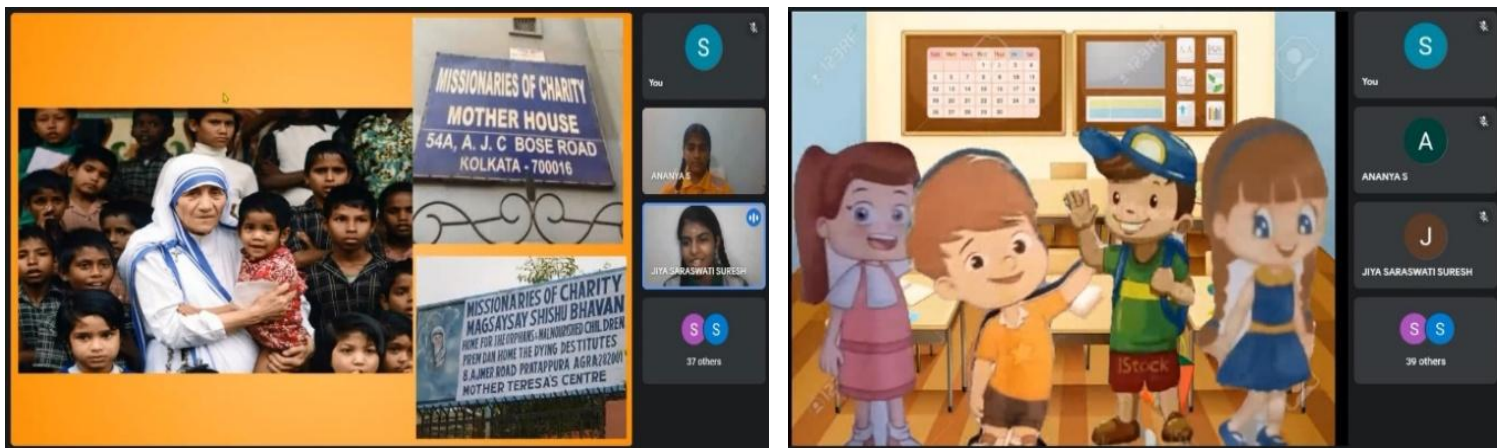
Teachings of Mother Teresa – A Puppet Show