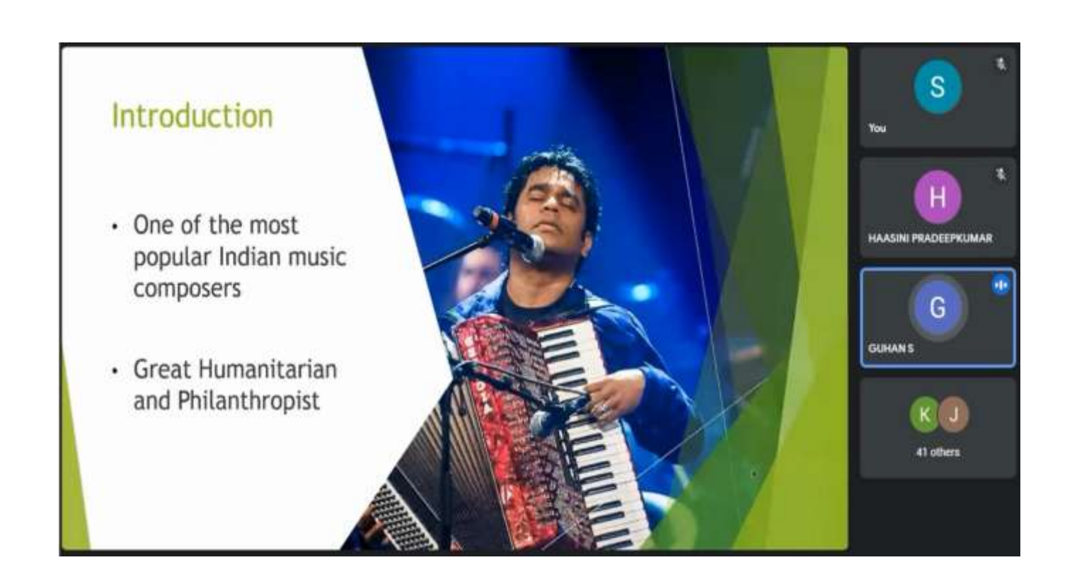
Pride of India - A.R. Rahman