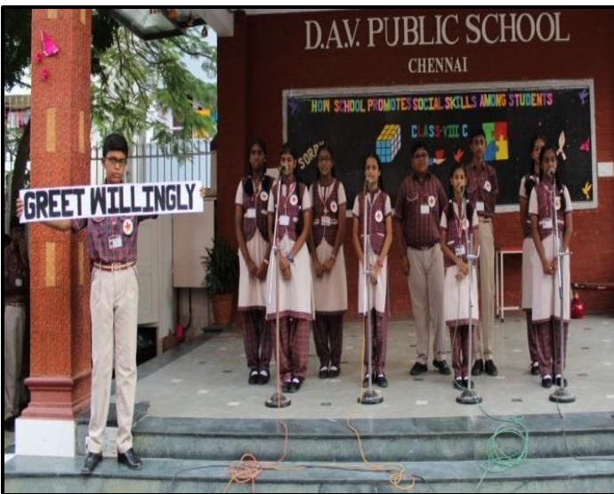
Musical Welcome Song