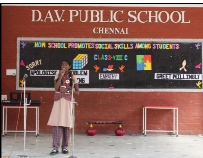
Expression of Gratitude