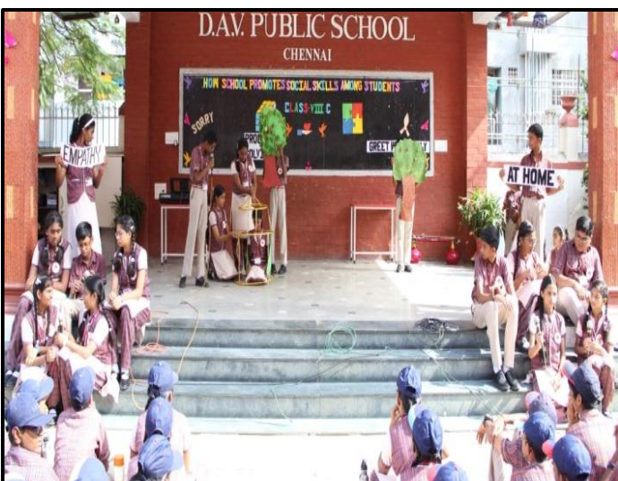
'Hum Panchi Unmukt Gagan Ke' – Dance Drama