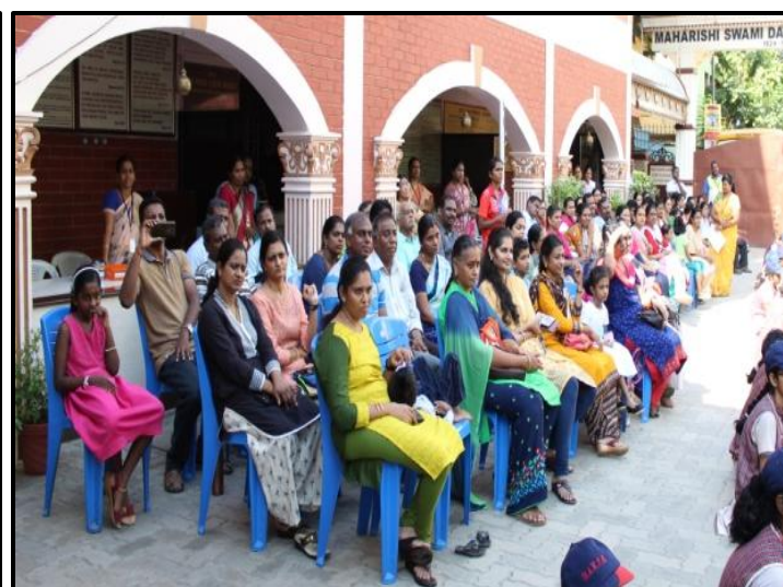
Parents Witnessing the Assembly