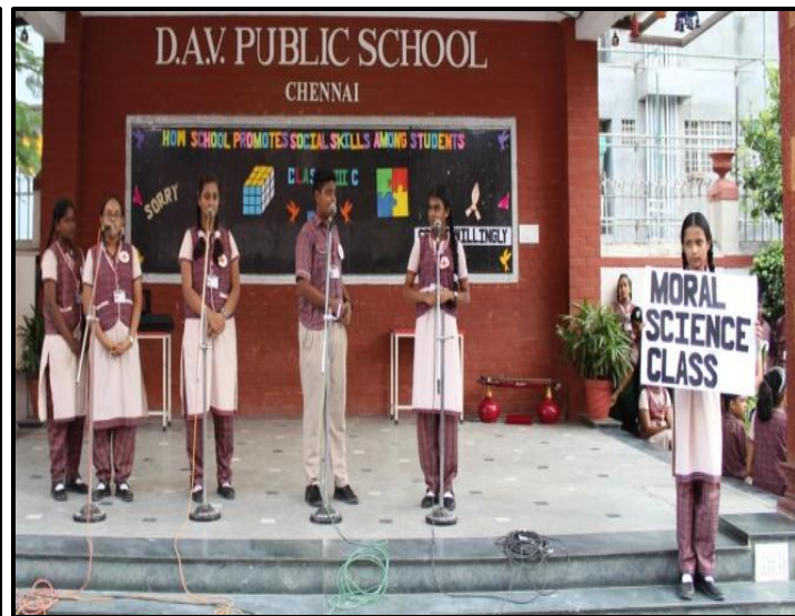
Talk It Out - Debate