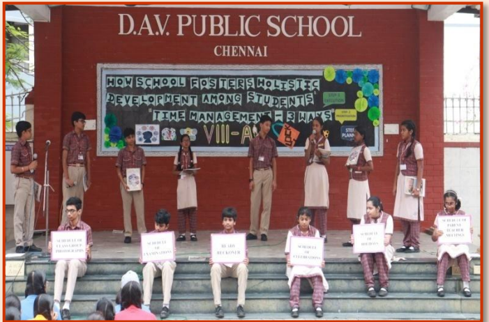
Rendezvous with the Ready Reckoner