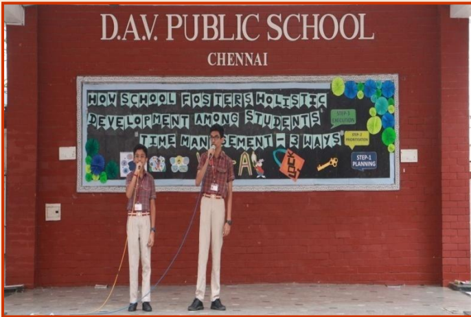
Eloquent Exposition on Holistic Development