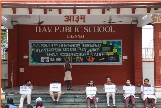
Peroration on Prioritisation