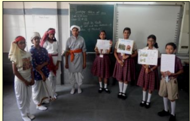
Types of soil and methods of cultivation of different types of millets were well explained