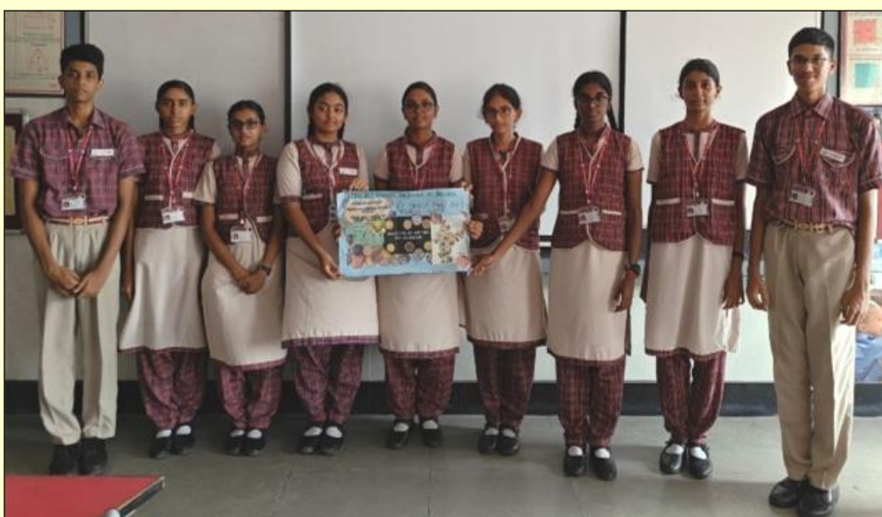
“Exploring Nutrient rich Diversity: Millets Collage Adventure!”

This project served as a platform for students to showcase their creativity while refining their research skills. It equipped them with invaluable insights into millets, which are often overlooked treasures in India.