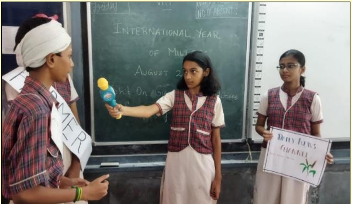
Farmers Expounding on Merits of Millets