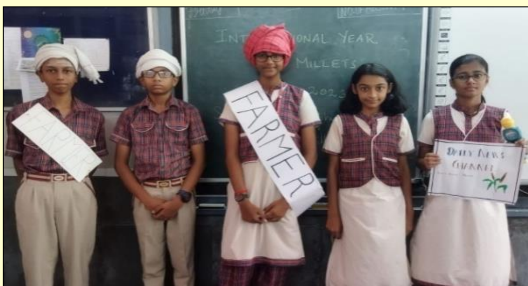
The Ensemble Cast Ready to Perform