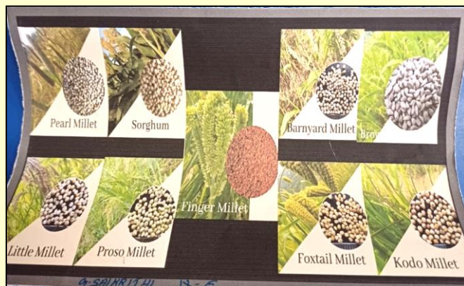
The collage says it all!!