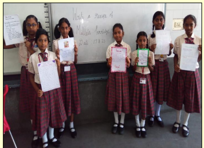
'Taste The Future' with Innovative Millet Recipe Presented by Students