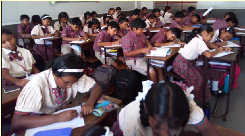
Millet Makeover: Students Elevating Everyday