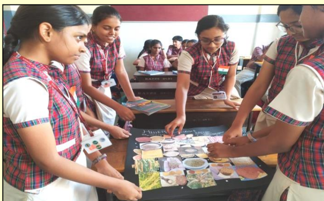
An Insight into Different millets - common and rare!!