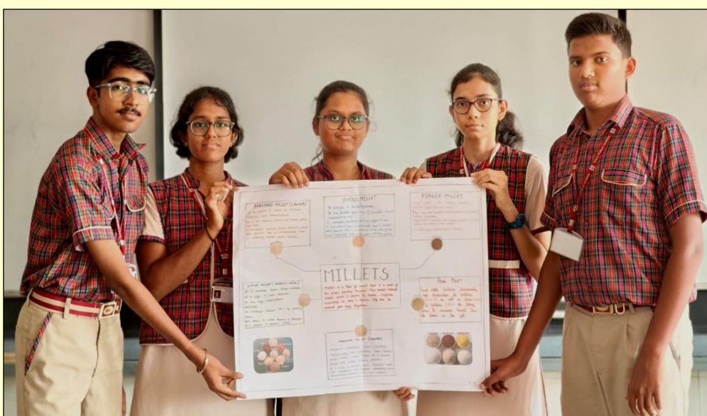
“Millets Galore: A Mosaic of Wholesome Goodness!”