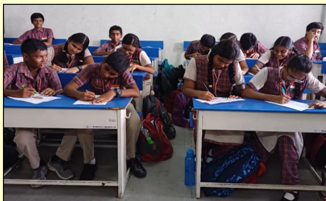
Designing a collage can be fun!!