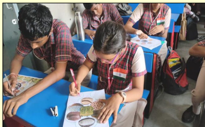
Engrossed in Collage Making