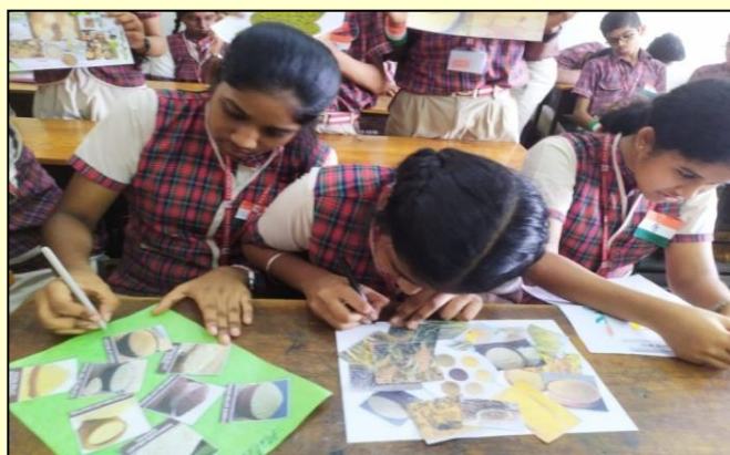
Working with Millets