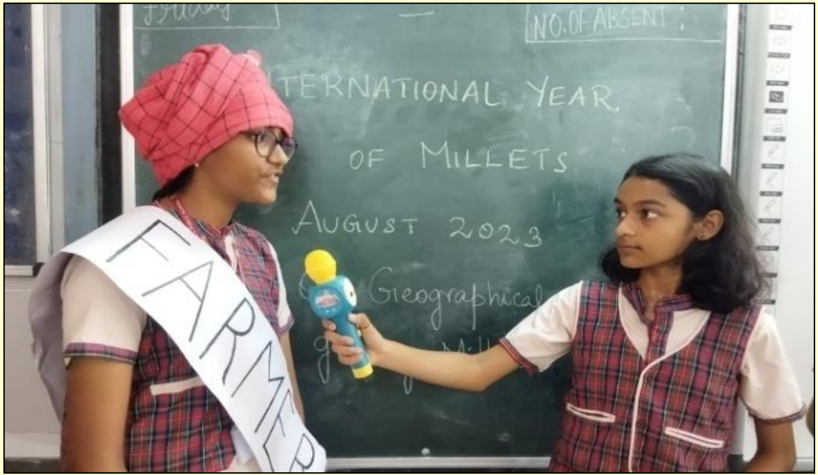
Curious Journalist Questioning a Farmer