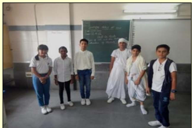
Illustration of the benefits of consuming millets