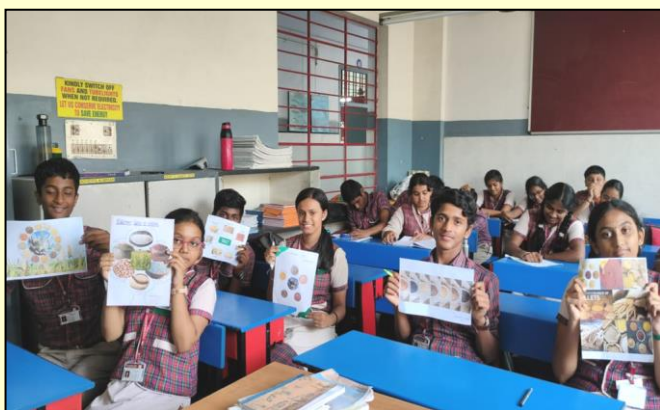
Millets Millets show 'em all!!

This activity helped the students to recognize the different types of millets available for consumption in day to day life and inspired the students to include healthy millets in their meals.