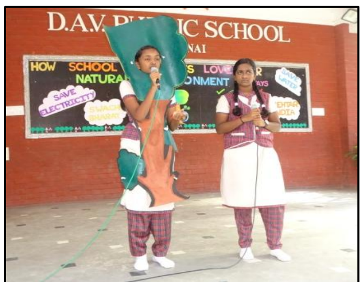
A Talk on "Stop Exploiting Nature"

TOPIC: HOW SCHOOL INCULCATES LOVE FOR THE NATURAL ENVIRONMENT-5 WAYS