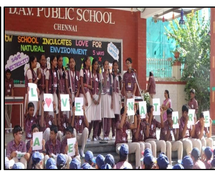
Students performing a self composed song - "Love Nature"