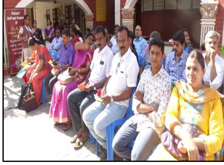
Parents enjoying the show