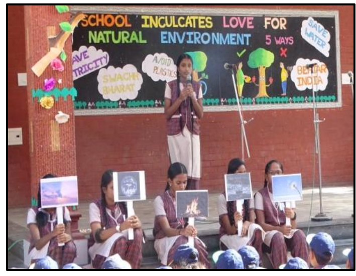
Vote of thanks, 'the green way'