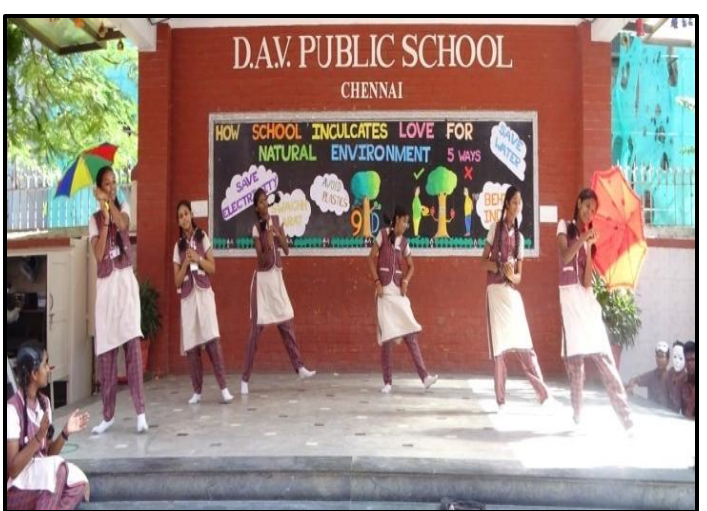
Students performing "Rain Dance"