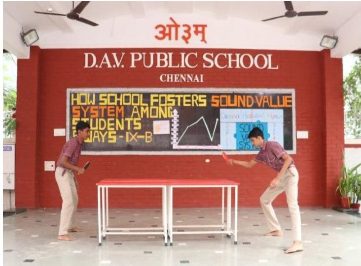
The Co- ordination Duo