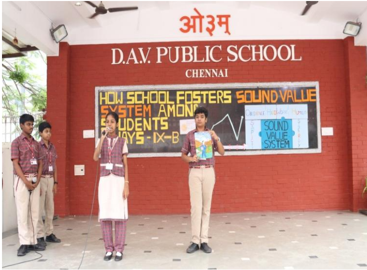
Insightful Discussion on Sound Value System