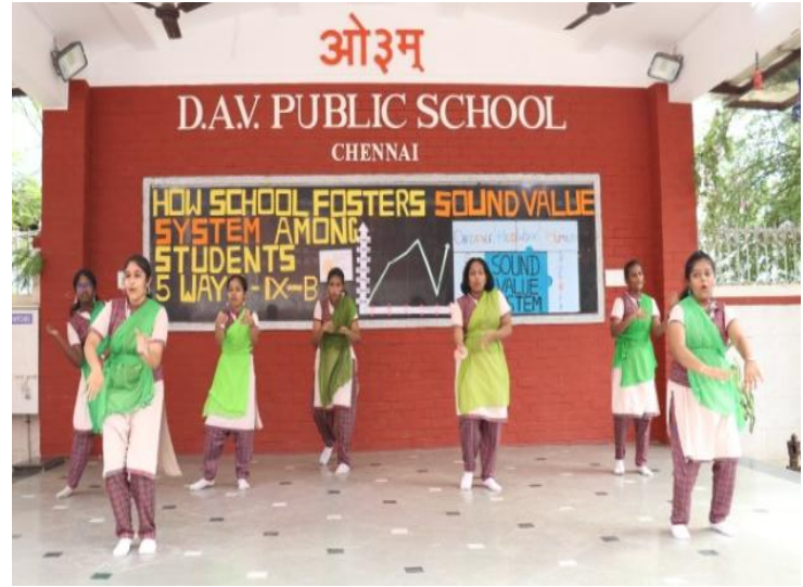
Dance on Humility