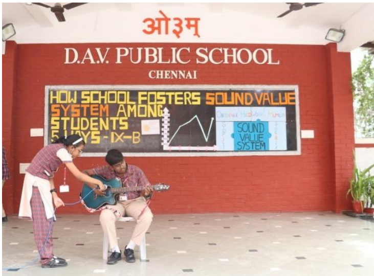
Talent Galore – Musical Treat