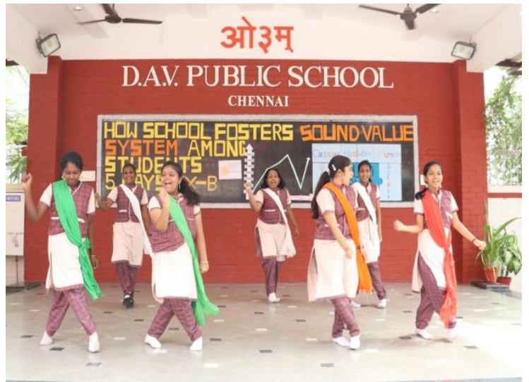
Patriotic Fusion Dance