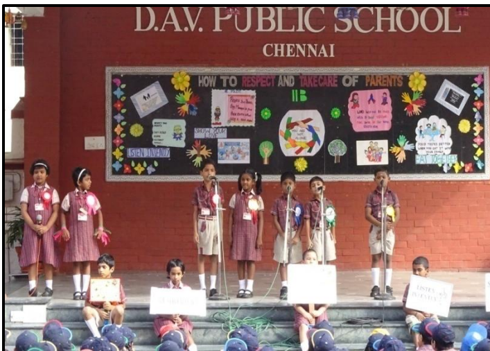
Speech - "Matru Devo Bhava, Pitru Devo Bhava"