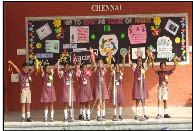
Group Song – Welcoming the Parents