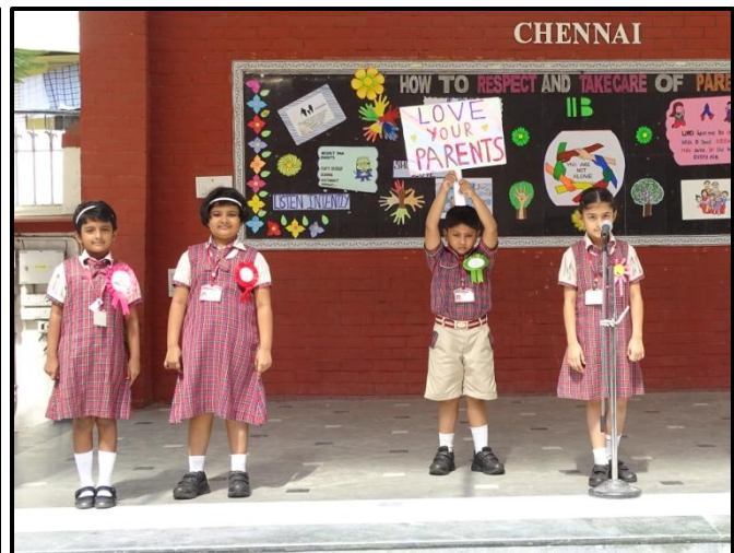
"Parents our Life Line"