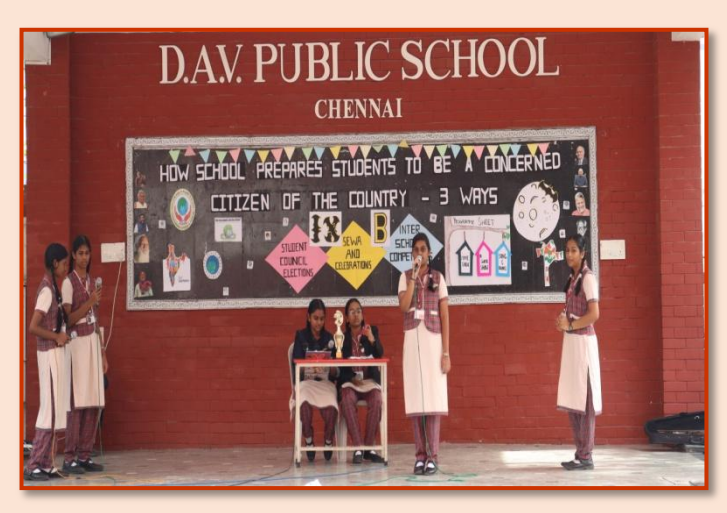
Minute to Win It – The Game Show