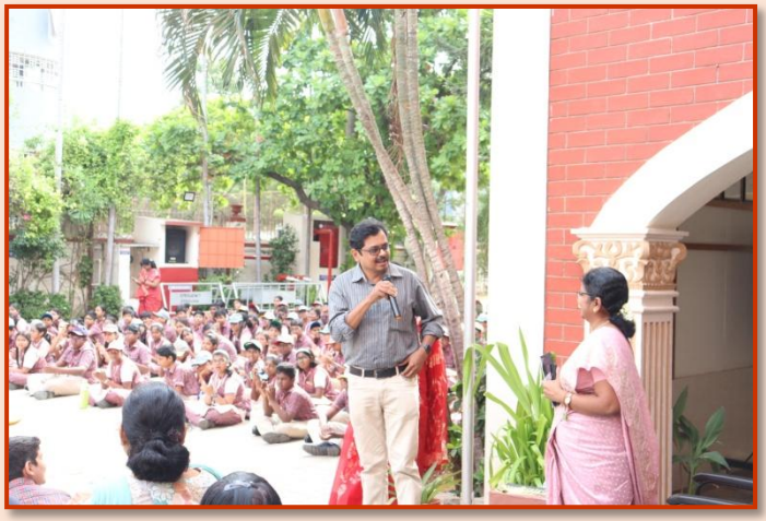
Parent's Positive Feedback on School's Effort to Instill Human Values